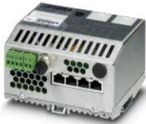
Ethernet Smart Managed Compact Switch with four 10/100 Mbps RJ45 ports, PROFINET mode (default)

Please be informed that the data shown in this PDF Document is generated from our Online Catalog. Please find the complete data in the user's documentation. Our General Terms of Use for Downloads are valid ( http://phoenixcontact.com/download )