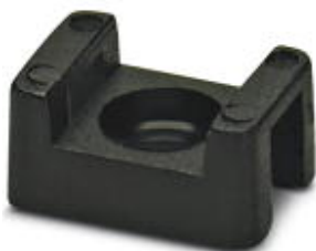
Cable binder base, for cable binders up to 5 mm wide, screwable, 3.5 mm fixing hole, 2-sided cable binder feed-through

Please be informed that the data shown in this PDF Document is generated from our Online Catalog. Please find the complete data in the user's documentation. Our General Terms of Use for Downloads are valid ( http://phoenixcontact.com/download )