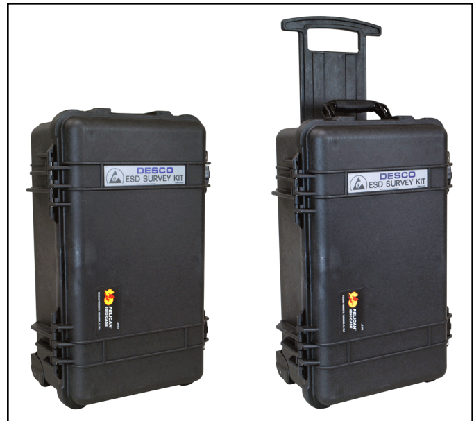
Figure 3. Extendable handle on the carrying case