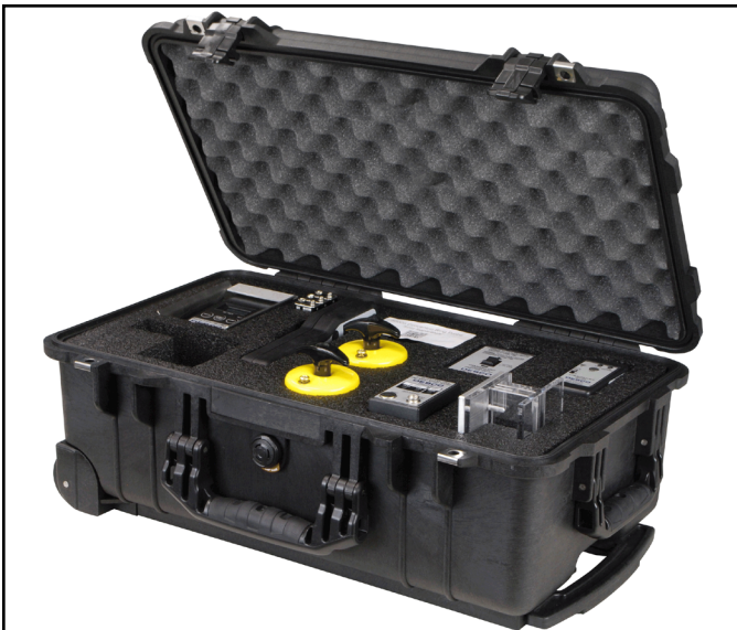
Figure 2. Desco 50569 ESD Survey Kit, Asia, 220VAC