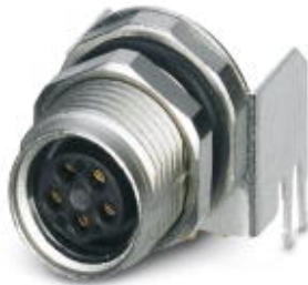
Sensor/actuator flush-type plug-in connector, socket, 5-pos., DeviceNet, M8, rear/screw mounting with M10 fastening thread, with angled solder connection

Please be informed that the data shown in this PDF Document is generated from our Online Catalog. Please find the complete data in the user's documentation. Our General Terms of Use for Downloads are valid ( http://download.phoenixcontact.com )