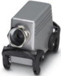
Hood, with double locking latch, height 65 mm, with screw connection, 1x Pg21, lateral cable entry

Please be informed that the data shown in this PDF Document is generated from our Online Catalog. Please find the complete data in the user's documentation. Our General Terms of Use for Downloads are valid ( http://phoenixcontact.com/download )