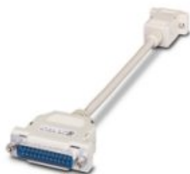
RS-232 cable, 9-pos. D-SUB socket 25-pos on D-SUB socket

Please be informed that the data shown in this PDF Document is generated from our Online Catalog. Please find the complete data in the user's documentation. Our General Terms of Use for Downloads are valid ( http://phoenixcontact.com/download )