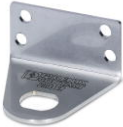
Angled bracket for individually fixing CN-UB... to housing panels, for example.

Please be informed that the data shown in this PDF Document is generated from our Online Catalog. Please find the complete data in the user's documentation. Our General Terms of Use for Downloads are valid ( http://phoenixcontact.com/download )