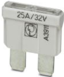
Flat-type plug-in fuse, type C, color code: white, nominal current: 25 A

Please be informed that the data shown in this PDF Document is generated from our Online Catalog. Please find the complete data in the user's documentation. Our General Terms of Use for Downloads are valid ( http://phoenixcontact.com/download )