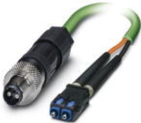
Assembled FO cable, round cable, 980/1000 µm POF fiber, M12 fiber optic connector to SC-RJ/IP20

Please be informed that the data shown in this PDF Document is generated from our Online Catalog. Please find the complete data in the user's documentation. Our General Terms of Use for Downloads are valid ( http://phoenixcontact.com/download )