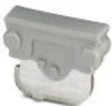
Spare knife, Length: 10.5 mm, Width: 4 mm, Color: gray