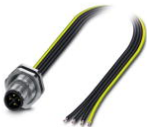
Flush-type connector, Power, 4-position, Plug, Link: M12, S power, Rear mounting, M16 x 1.5, Individual wires, Cable length: 0.5 m

Please be informed that the data shown in this PDF Document is generated from our Online Catalog. Please find the complete data in the user's documentation. Our General Terms of Use for Downloads are valid ( http://phoenixcontact.com/download )