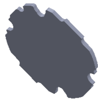
3D View Scale:- 2:1