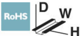
The figure shows EMG 17-REL/KSR-G 24/2E/SO38

Relay module, with soldered-in miniature switching relay, contact (AgNi): Medium to large loads, double A2 connection, 1 PDT, 120 V AC/DC input voltage