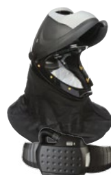
APF 1000 L-905 with Adflo