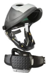
APF 25 L-705 with Adflo