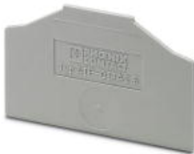
Partition plate, Length: 55 mm, Width: 1.5 mm, Height: 51 mm, Color: gray

Please be informed that the data shown in this PDF Document is generated from our Online Catalog. Please find the complete data in the user's documentation. Our General Terms of Use for Downloads are valid ( http://download.phoenixcontact.com )