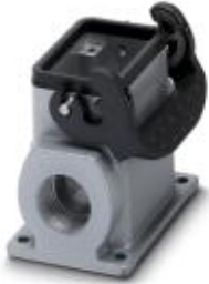
HEAVYCON box mounting base B6, with single locking latch. Height 74 mm, with supports 2x M32

Please be informed that the data shown in this PDF Document is generated from our Online Catalog. Please find the complete data in the user's documentation. Our General Terms of Use for Downloads are valid ( http://phoenixcontact.com/download )