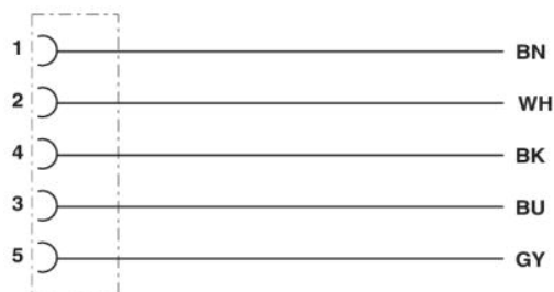
Contact assignment of the M12 socket